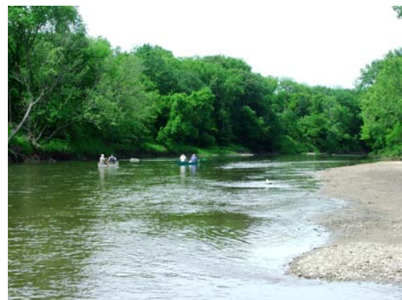
Fig. 2—Canoeists enjoy Boone River float trip