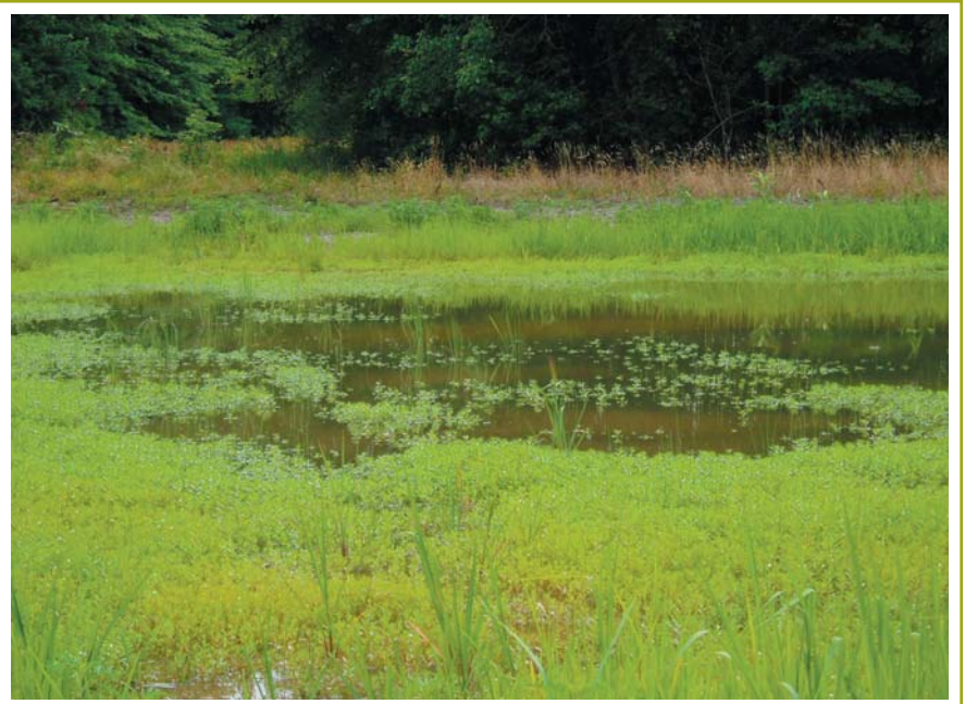
Wetlands created on private land