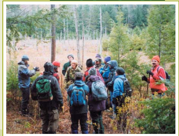
Vermont Community Wildlife Program Outing

103 South Main Street Waterbury, VT 05671-0401 http://www.vtfishandwildlife.com/SWG_CWCS.cfm