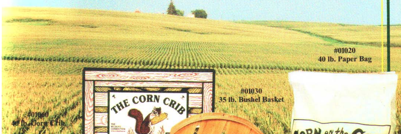
#01060 40 lb. Corn Crib

WILDWOOD FARMS, INC. 1011 22nd Ave. FULTON, IL 61252 (815) 589-3366