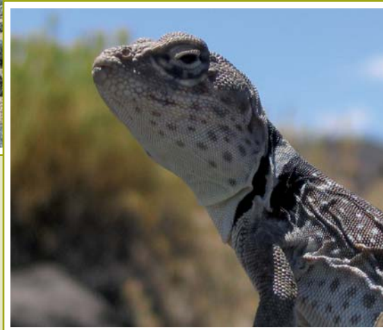
Collared Lizard

With the help of experts from all taxonomic fields, the Plan Team identified a total of 263 Species of Conservation Priority, including 72 bird species, 49 mammal species, 40 fish species, 20 reptiles, 7 amphibians, 74 gastropods, and 1 bivalve. GIS and documented occurrences of