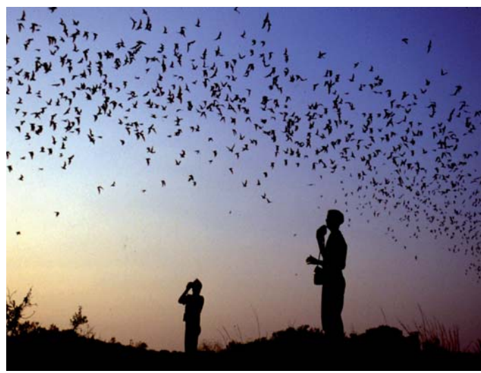
Watching wildlife in Oklahoma/ODWC

water mussels unique to eastern regions of the country. In the prairies of western Oklahoma, globally rare species are found, such as the Texas Horned Lizard,