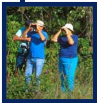
Birdwatchers, Photo Courtesy of Massachusetts DFW

In the five years since its inception, the State Wildlife Grants Program has played an important role in the conservation of Massachusetts' wildlife. The following are some of the projects funded through State Wildlife Grants: